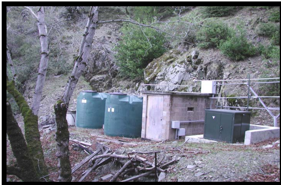
North Spring Storage Tanks