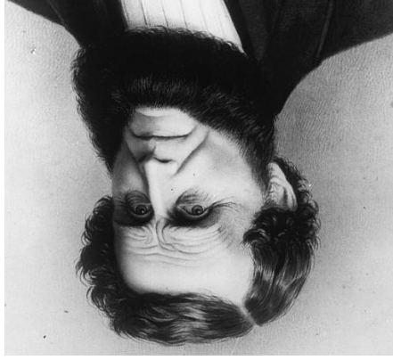
James Lick (1796–1876)

Lick Observatory was the world's first permanently equipped mountaintop astronomical observatory. It demonstrated the feasibility of sustained work at a high, remote site, where the best observing conditions are found. Almost all subsequent research observatories have followed suit. Lick's pioneering influence and inspirational contributions to science are acknowledged by astronomers worldwide.